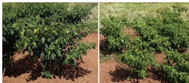
TREATED WITH HYDRETAIN®